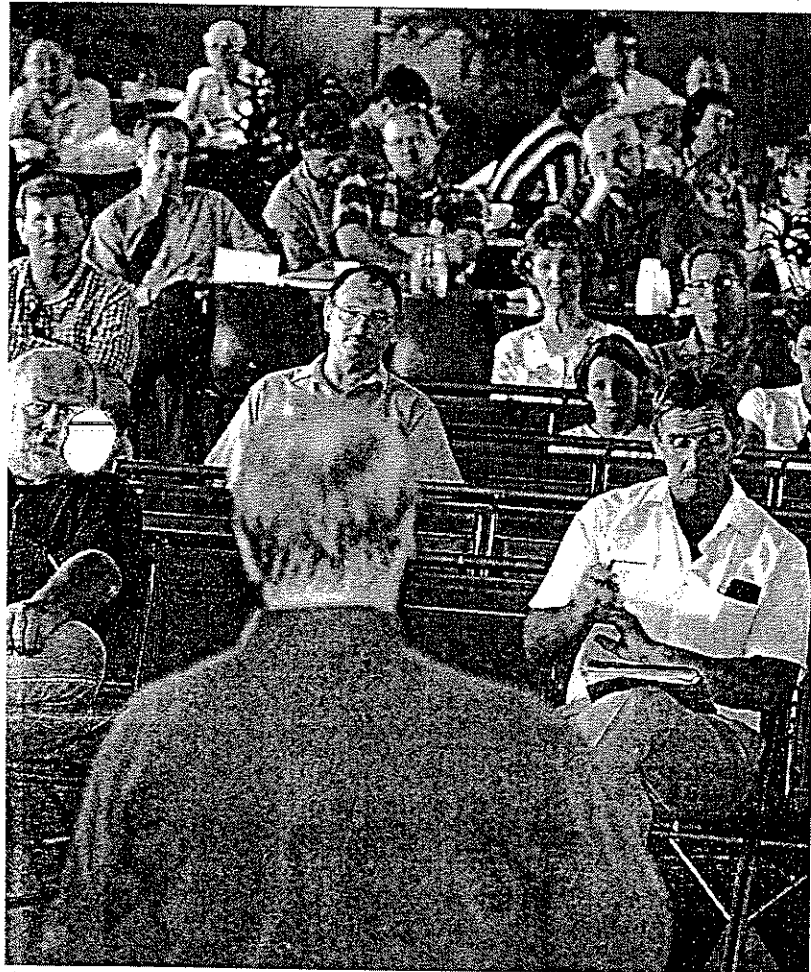
Public forum chaired by Premier Peter Beattie.