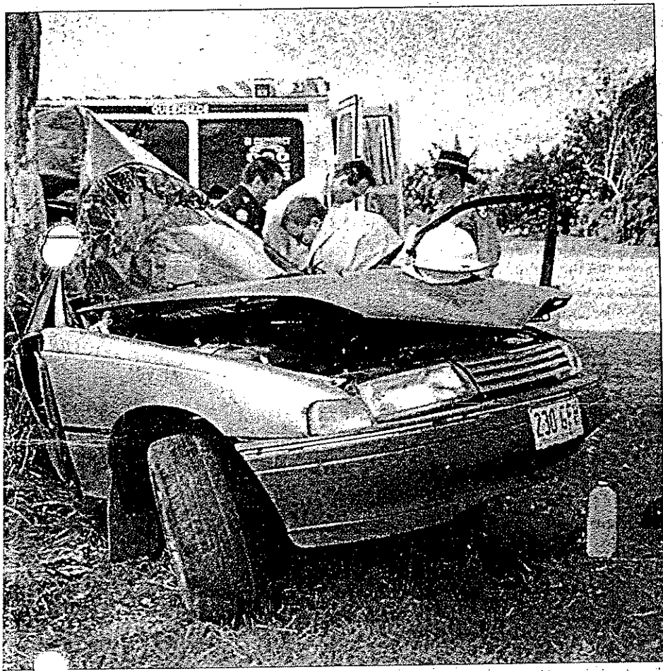
on Goourrum Road.